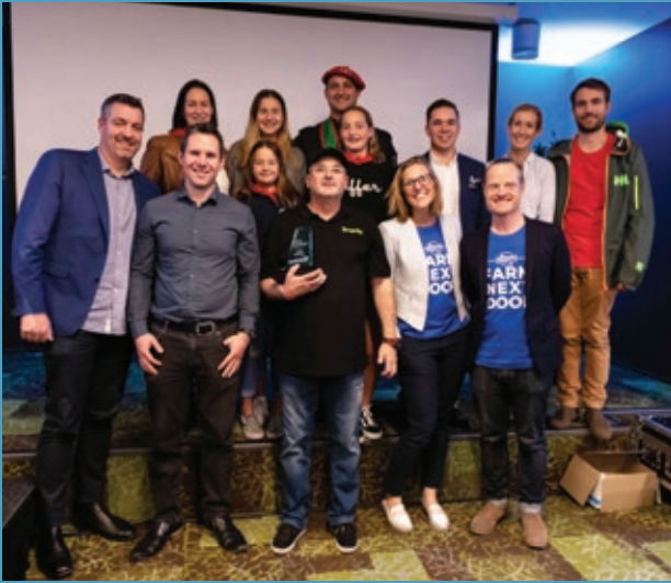
Idea Summit Taranaki 2019 finalists.