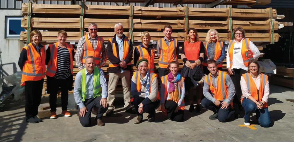
Educators and Enterprises, South Taranaki tour at Total Aluminium