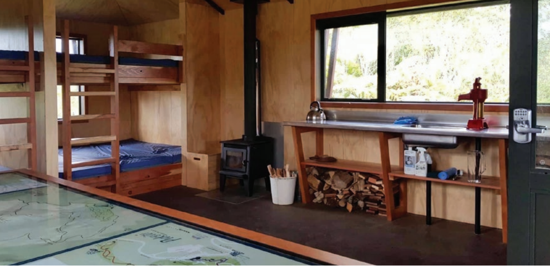
The Piwakawaka Family Hut at Pukeiti

centre of a public exhibition focused on the stories of Māori and Pākehā on this site.