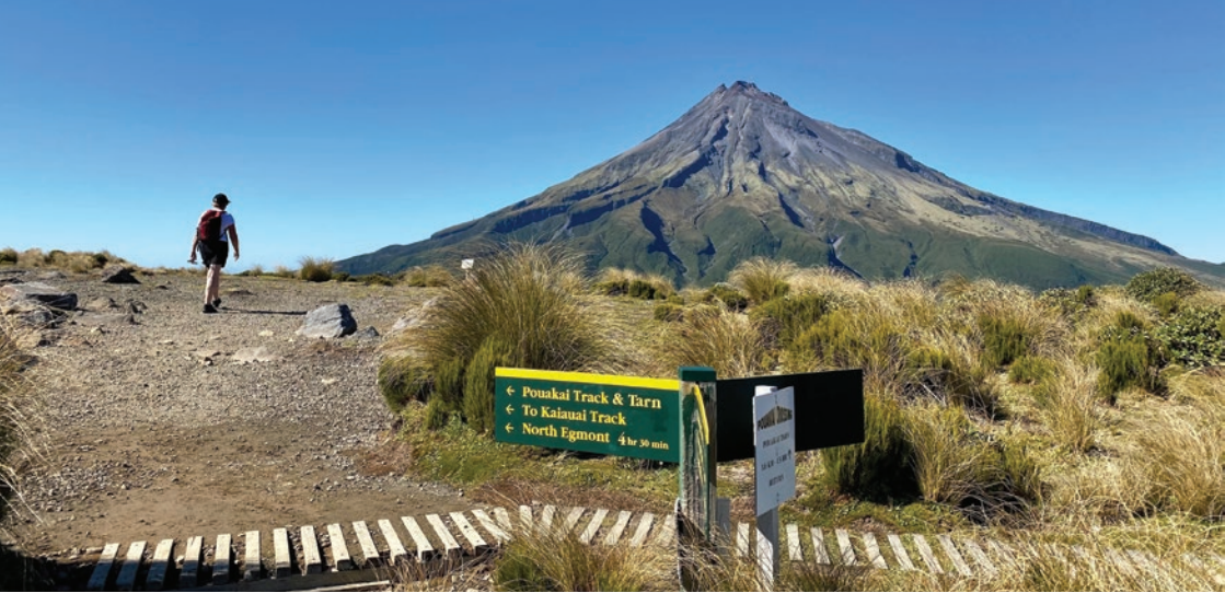
Taranaki Maunga and the Pouakai Track