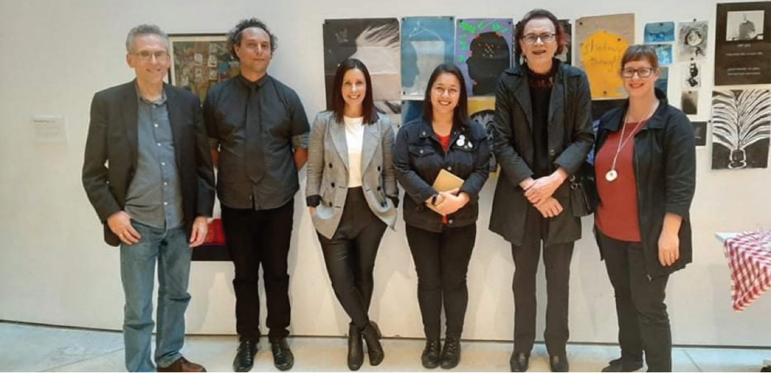
Members of the Creative Taranaki Lead Team